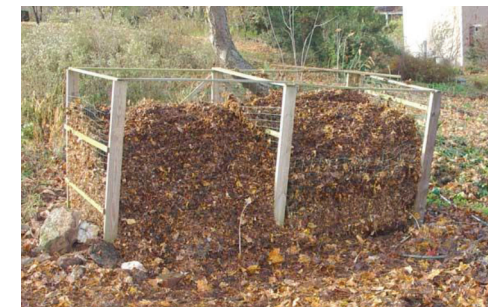
Figure 2: Shredded Leaf Compost Pile

empty the mower bags into your compost pile. (See photo below) If you cover the compost pile with a tarp and turn the pile every few weeks, you will have an excellent leaf compost for your spring planting beds. Pound for pound, the leaves of most trees contain twice as many minerals as manure.