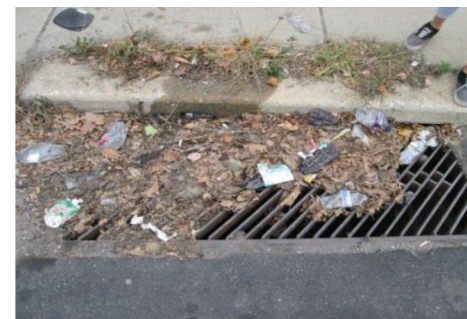
Figure 1: Trash & Leaf Litter on Inlet

Water pollution from leaf litter happens when leaves are not cleaned up, or they are haphazardly dumped into a swale or waterway. Leaves left to decompose in your yard are susceptible to being carried into local waterways. Leaf litter disposed of in swales and channels are traveling directly into local waterways. Decomposing of leaf litter releases excess phosphorus into the water system which means more algae blooms in waterways resulting in less oxygen for fish and other wildlife.