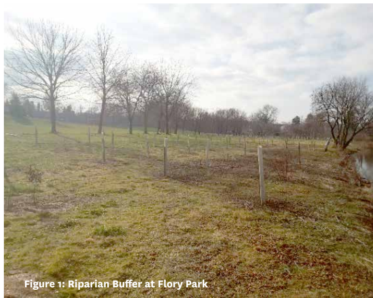
Figure 1: Riparian Buffer at Flory Park

If you have any stormwater questions feel free to contact me at ckadwill@eastlampetertownship.org or (717) 393-1567.