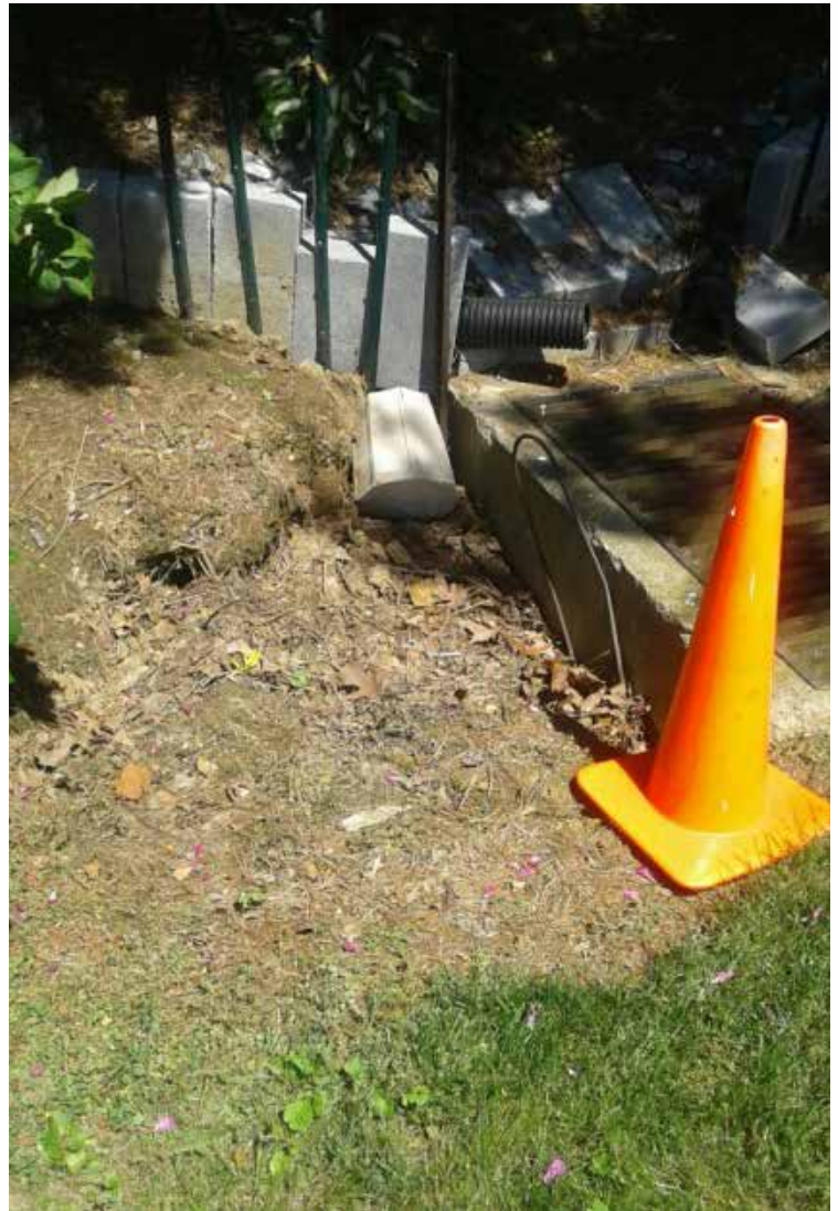
This sinkhole was caused by a pipe separating from the structure and allowing water in through a void.

The main takeaway on these and most other sinkhole cases is be aware and know what to look for. Often times the “monster” sinkholes that we hear about on the news are simply long term undiscovered sinkholes. If you suspect a sinkhole in the public right of way or on Township Property or if you suspect a sinkhole on your property and are unsure of what you are to do next, be sure to call the Township office at 717-393-1567 x3528.