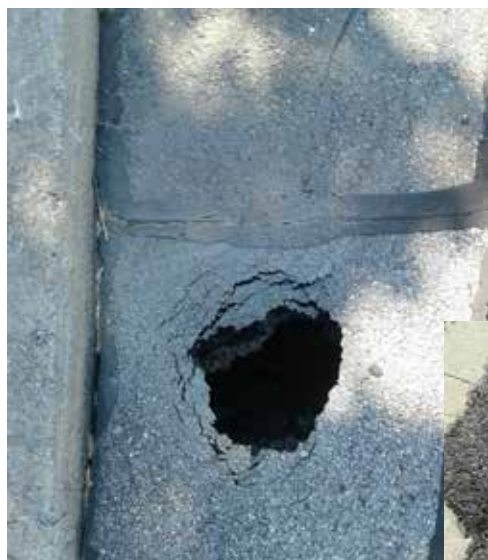
Above: This sinkhole was a result of a corroded pipe which was exaserbated by hydrant flushing.