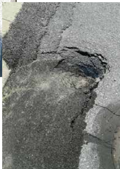
Right: This sinkhole was a repeat, which ended up being the result of corroded pipe as well.