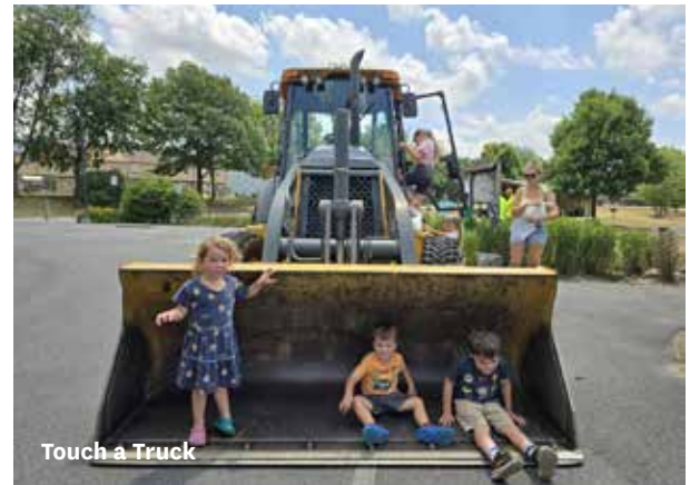
Touch a Truck

In case you missed our Fall Festival on October 5th, in conjunction with PA Healthy Land Week, there were fall-themed children's activities and a Kokedama workshop for adults. If you happen to have free time on Tuesday or Thursday mornings, consider joining the 9 a.m. Morning Walking Club. As we move forward with planning community events, fitness classes, continuing education classes, and many other recreational opportunities, please reach out to our recreation director with ideas of what you would like to see. Families, please put East Lampeter Township's Summer Playground on your calendar for the summer of 2025, more details to follow. Look for current and upcoming programs on the Township website under the Parks and Recreation drop-down tab. ( https://eastlampetertownship.org )