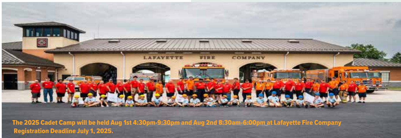
The 2025 Cadet Camp will be held Aug 1st 4:30pm-9:30pm and Aug 2nd 8:30am-6:00pm at Lafayette Fire Company Registration Deadline July 1, 2025.