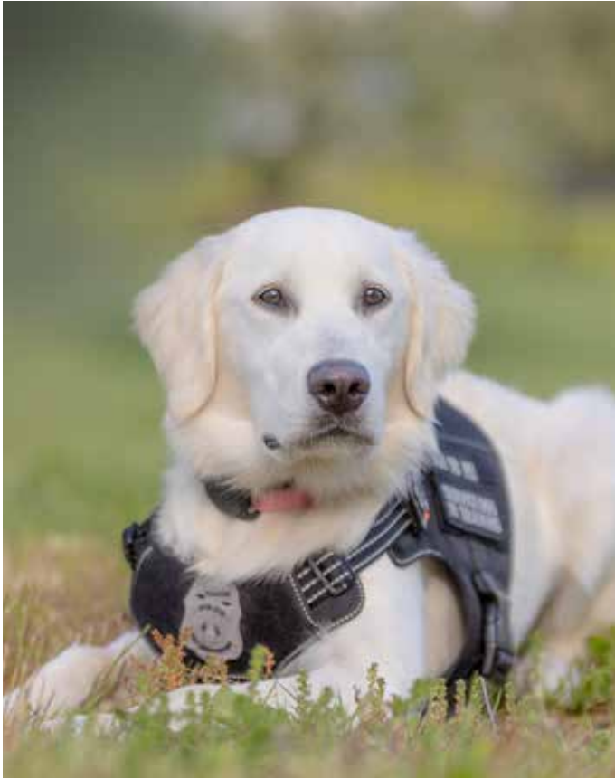
East Lampeter Township Police Department's trauma dog, Seija.